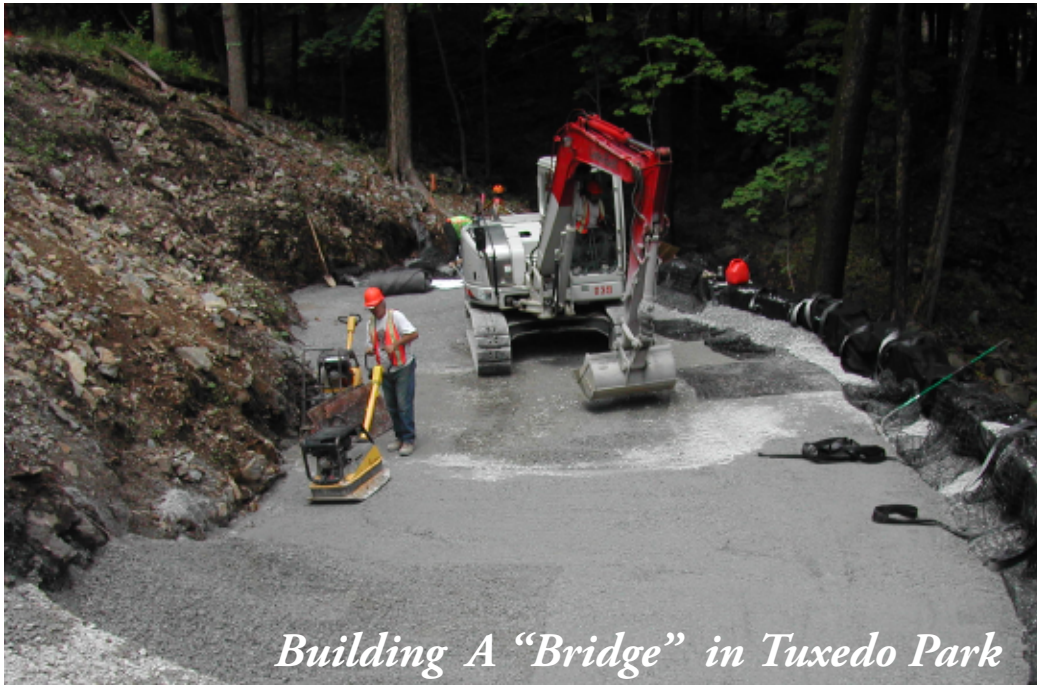
Building A “Bridge” in Tuxedo Park

Tuxedo Park, a gated village 40 miles outside of Manhattan, was established in the late 19th century as a luxury resort. Many of the residences were designed by influential architectural firms of the Gilded Age including Delano & Aldrich, Carrere & Hastings, and McKim Mead & White. The village became famous for its high-profile residents, beautiful homes, and grand events. (In fact, the evening dress for men now popularly known as the “tuxedo” takes its name from Tuxedo Park, where it was said to have been worn for the first time in the United States, at the annual Autumn Ball of the Tuxedo Club). In recent years, the village has witnessed a revival; aging homes once abandoned, have been restored, bringing the secluded village back to its original splendor as a quiet refuge close to Manhattan.